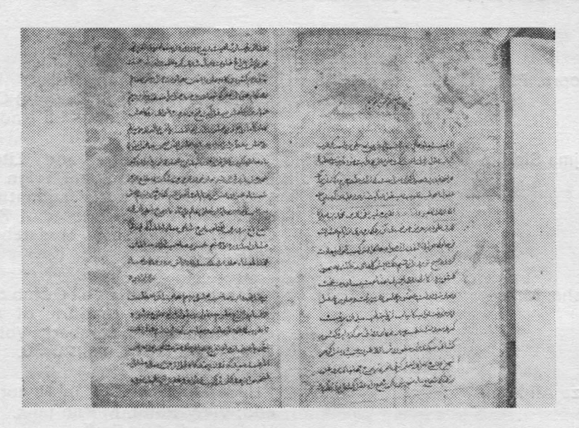
Fig. 1: First page of the manuscript Mizan-ut-Taba-e-Qutub Shahi, (Acc. No. 266) is showing the name of the author.